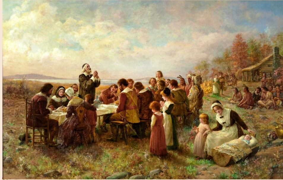
Title: The First Thanksgiving at Plymouth Brownscombe Painting, 1914.