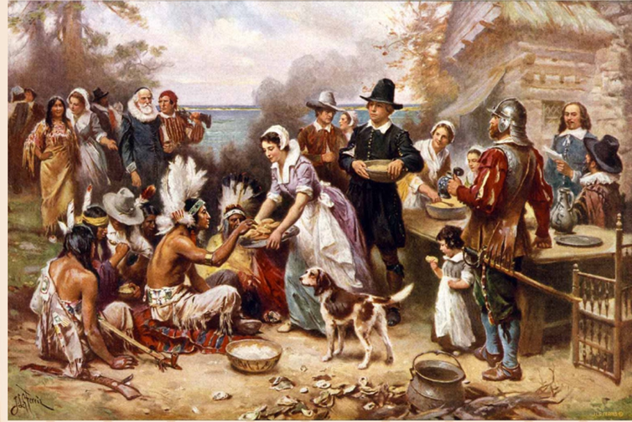
Title: The First Thanksgiving Ferris Painting, 1915.