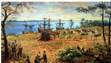
Building the Jamestown Fort