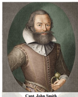
Capt. John Smith

Jamestown needed a leader and along came John Smith. You may have heard of him and we will come back to him soon. Smith had the colonists build a fort (see an image below) and told the colonists that, "he that will not work, shall not eat!" People started working. He also started trading with Native Americans for food.