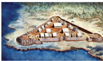
The Original Jamestown Fort/Colony