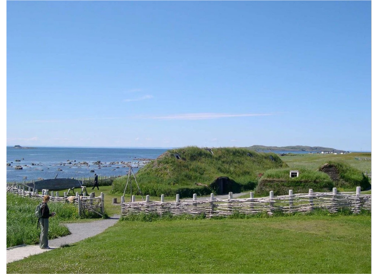
A recreation of Viking structures at L’Anse aux Meadow