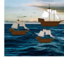
Scene 2: _____