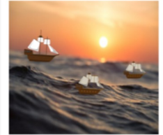
Scene 3: _____