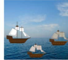
Scene 5: _____