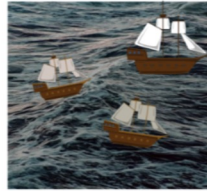
Scene 4: _____