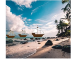
Scene 6: _____