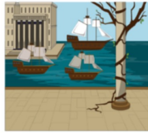
Scene 1: _____

Make sure you include dates and brief quotes from the log entries on your storyboard.