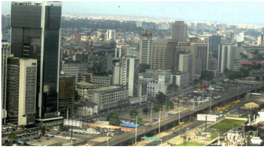
Lagos Nigeria (21 million)

Misconception : nearly half of the people in Africa live in urban areas like the places shown below.