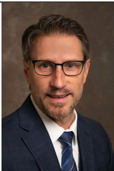
Secretary of Education SBE Executive Secretary

The State Board of Education consists of nine members. Seven voting members who are appointed by the Governor, approved by the Senate. Two non-voting members appointed by the Governor. Background information on each member can be found here .