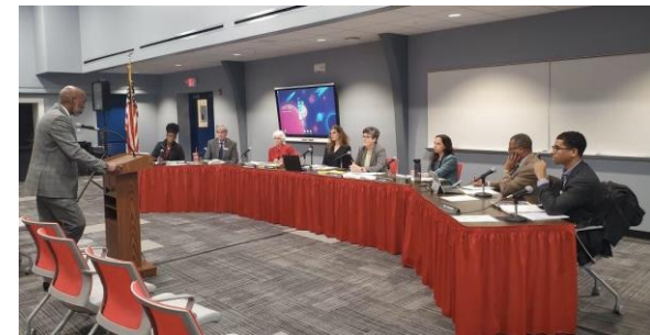
Figure 3: Superintendent Green presenting to the State Board in the Red Clay School District.

School District's teaching and learning model. Presenters provided information about the development of the District's teaching and learning model, stakeholder engagement, the theory of action, the roll out of the plan, and connections to professional learning opportunities.