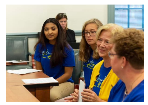
Figure 2: Students and staff from the Caesar Rodney School District present to the State Board.

District. They shared information regarding the Computer Science pathway, efforts to increase representation of female students, and initiatives underway in the district, including "Go Red for STEM", "Coding with Kindergarteners", "Bring a Friend to Code Day", "Girls Who Code", elementary STEM day, a partnership with the National Center for Women in Technology, the DigiGirlz event, and the Girls Go CyberStart competition.