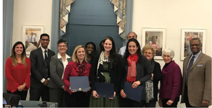
Figure 8: Board members with Presidential Awards for Excellence in Mathematics and Science Teaching Award Finalists.

Academy: The Board concurred with the recommendation of the Secretary and voted to renew the charter for Las Americas ASPIRA Academy for five years.